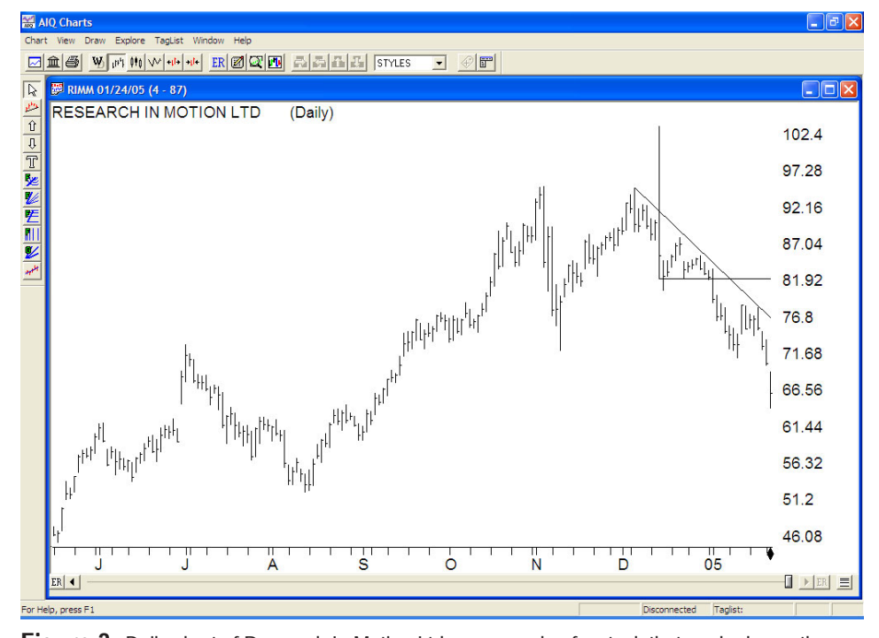
Figure 3. Daily chart of Research In Motion Ltd. an example of a stock that peaked near the end of 2004 and is currently continuing to decline.

More information on Dan Zanger can be found at www.chartpattern.com.